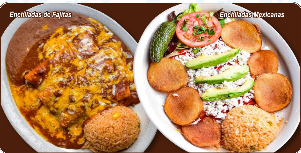
Enchiladas de Fajitas

Two shredded chicken or carnitas enchiladas in our house tomatillo and crema sauce. Topped with melted Monterey Jack cheese. Served with sliced avocados, pico de gallo, and sliced red onions. 14.95