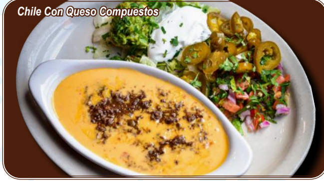
Chile Con Queso Compuestos

Mixed with onions, tomatoes, cilantro, garlic, and fresh lime juice. Small 7.95 Large 13.95