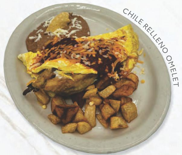
CHILE RELLENO OMELET