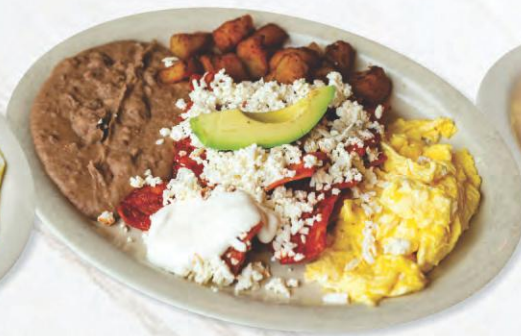
CHILAQUILES SALSA GUAJILLO