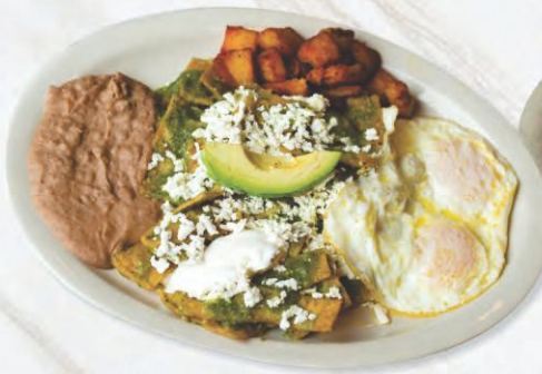
CHILAQUILES SALSA VERDE