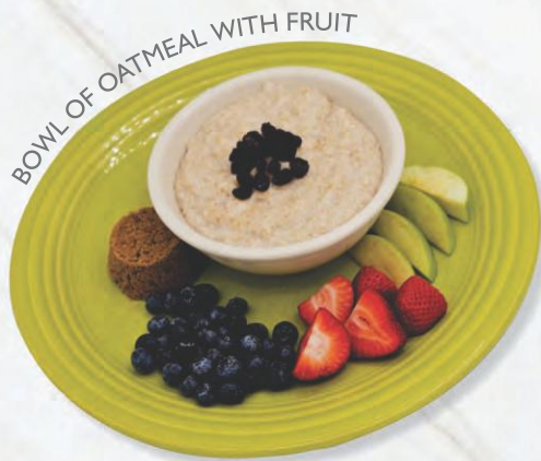
BOWL OF OATMEAL WITH FRUIT

Chicken Fajitas, Monterey Jack & Cheddar cheese, tomato, onion, mushrooms & jalapeño. WITH BEEF FAJITA $12.95